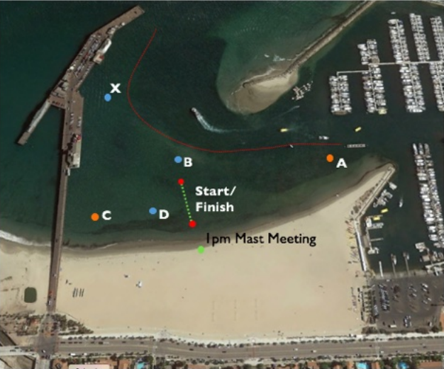
Figure 7-1: Aerial view of harbor and sailing area